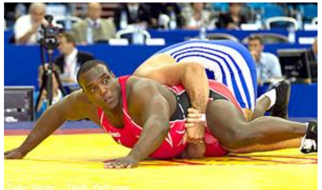
Par Terre Position

3 points out of 5 points (the head, 2 hands, 2 knees) are on the mat