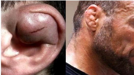
Ear before the clotting Ear after the clotting

Wearing headgears during practice will prevent this condition almost 100%. To treat it, go to an ear doctor and they will drain the blood from the ear to suppress the inflammation. Sometimes antibiotics are prescribed to prevent infections.